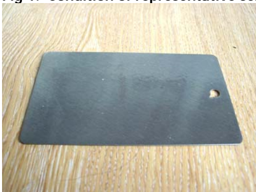
Fig 2. Condition of representative permanent coating at end of test